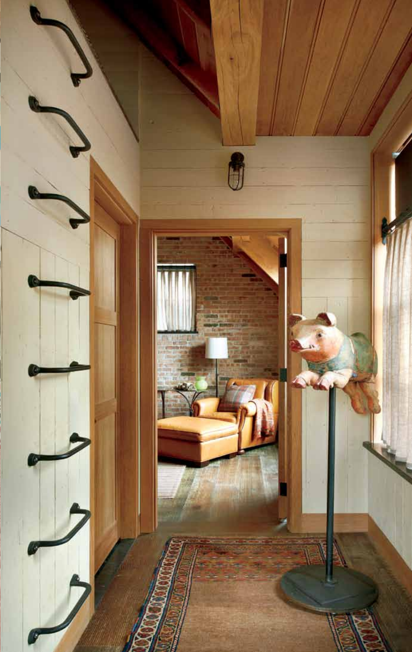
An existing leather chair provides a comfy lounging spot in the coach house guest bedroom; the Visual Comfort floor lamp was purchased at New Metal Crafts. The flying pig in the hallway is part of Novak's collection of vintage carousel animals from Italy.