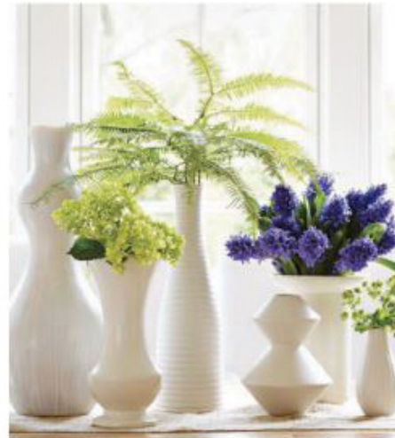
Breakfast room The kitchen opens to a casual dining area furnished with a whitewashed gray table and slipcovered chairs from RH. Homeowner Dawn McKenna. Flower vases Dawn's interestingly shaped monochromatic vases—some vintage, some new.

reads as one unit and creates a very large visual that works well in such a big room," O'Brien notes.