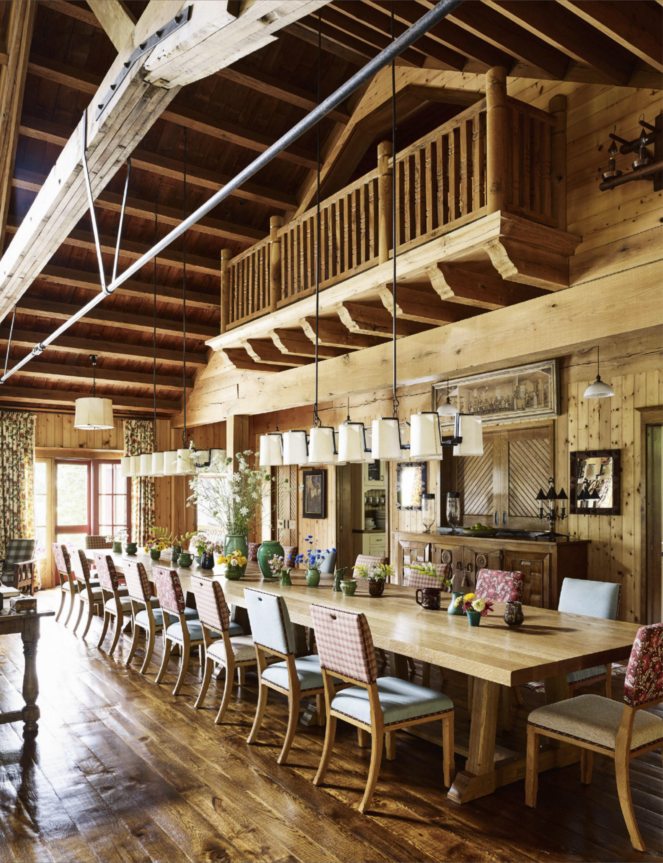
OPPOSITE CHAIRS BY SOANE IN FABRICS BY LE MANACH AND HOLLAND & SHERRY SURROUND A CUSTOM TRESTLE DINING TABLE. LIGHTING BY ROMAN THOMAS. BELOW DELAVAN LAKE BY DAY. RIGHT THE LITOWITZ FAMILY TAKES TO THE POOL.