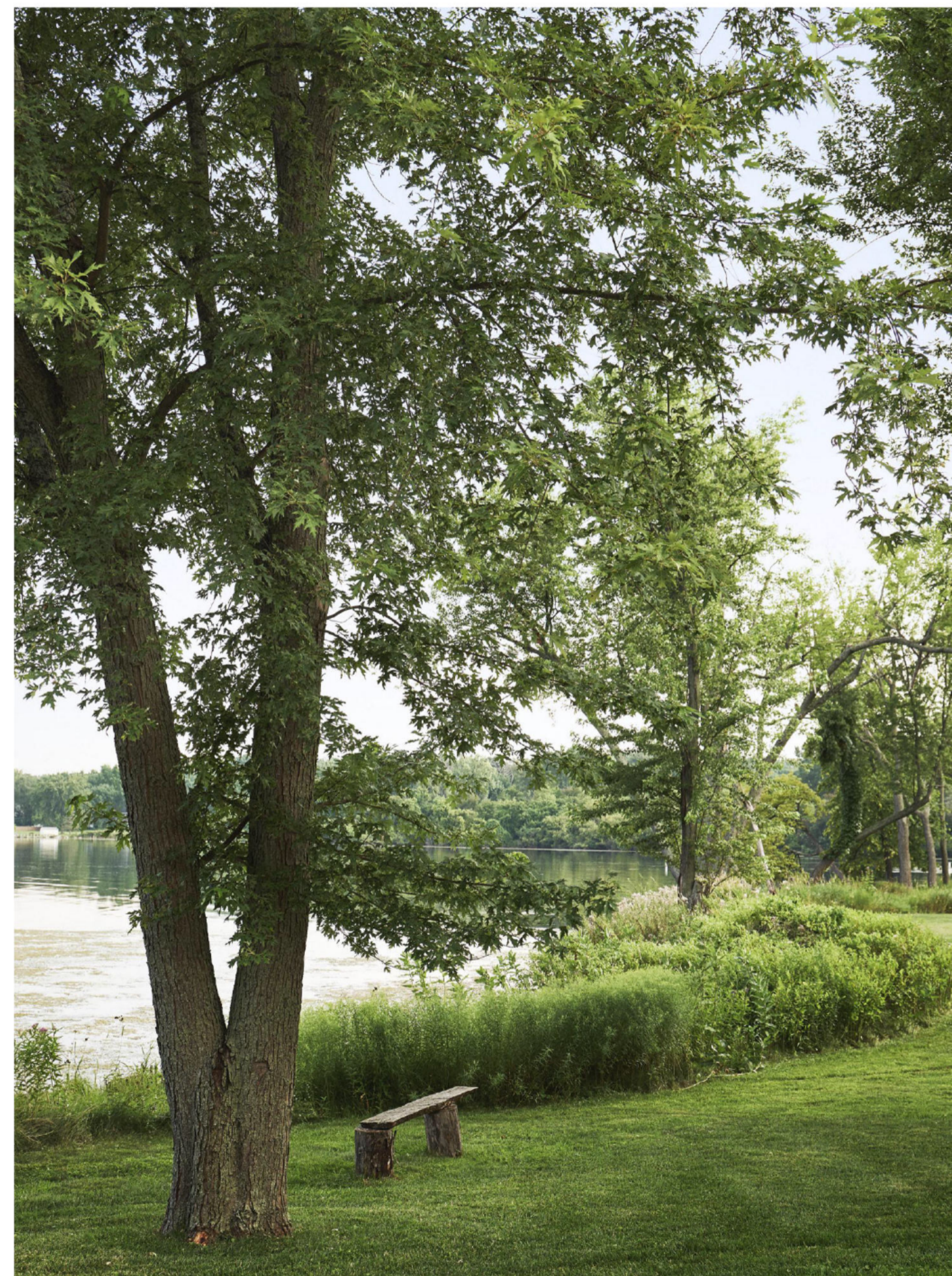
CLOCKWISE FROM ABOVE A RUSTIC BENCH BECKONS. THE KITCHEN'S PAONAZZO MARBLE-TOPPED ISLAND AND CABINETRY WERE DESIGNED BY LIEDERBACH AND GRAHAM, ARCHITECTS. FAMILY TIME IN THE GAME HOUSE, WHERE A CUSTOM POOL TABLE MEETS A VINTAGE TERMINATOR 2 PINBALL MACHINE.