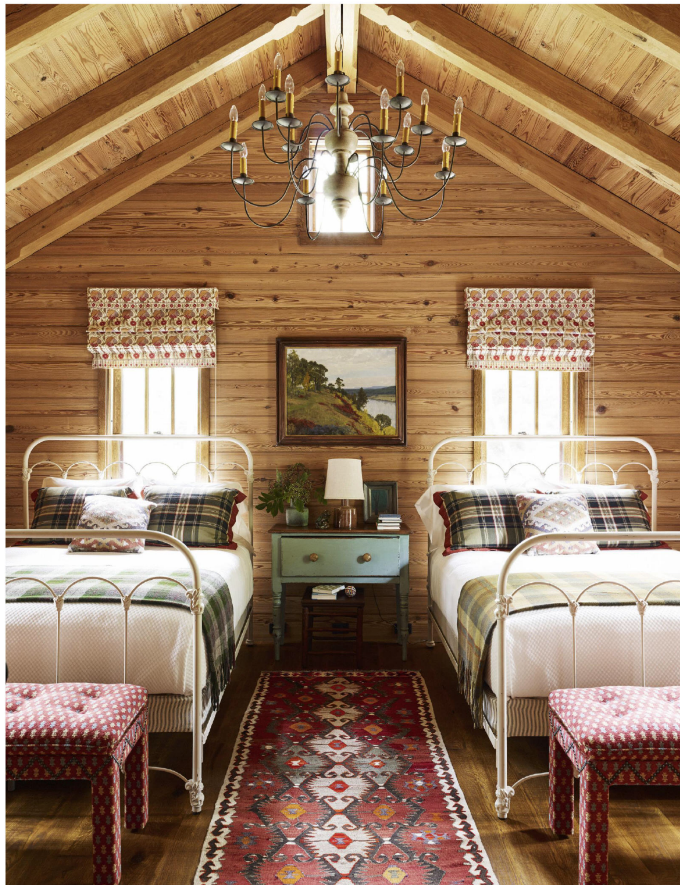
ABOVE IN THE EAST CABIN BEDROOM, CUSTOM IKAT BENCHES SIT AT ANTIQUE BED FRAMES FROM CATHOUSE BEDS. ROMAN SHADES OF A LE MANACH COTTON. OPPOSITE THE MASTER BATH FEATURES PEWABIC TILE AND A CAST-IRON TUB BY WATERWORKS. CALACATTA MARBLE-TOPPED VANITY DESIGNED BY LIEDERBACH AND GRAHAM, ARCHITECTS.